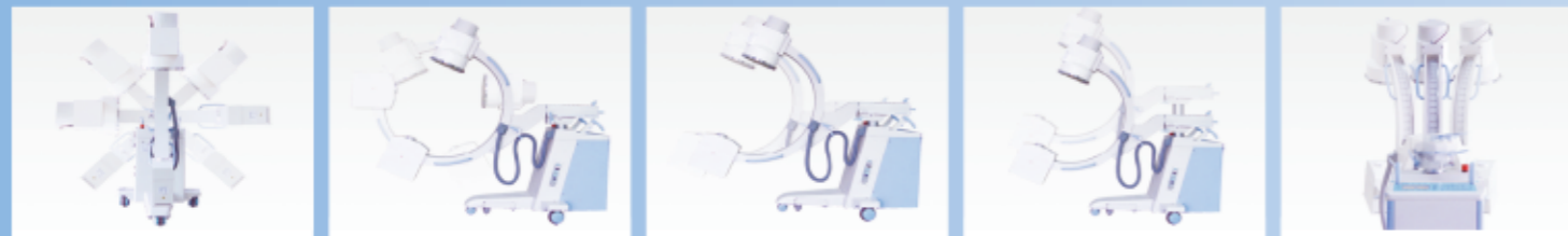
C-arm move around horizontal axis at \pm 180^\circ